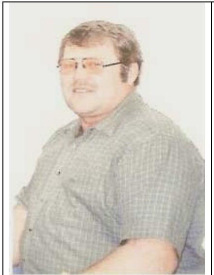
BEFORE ISAGENIX CLEANSE 305 Pounds