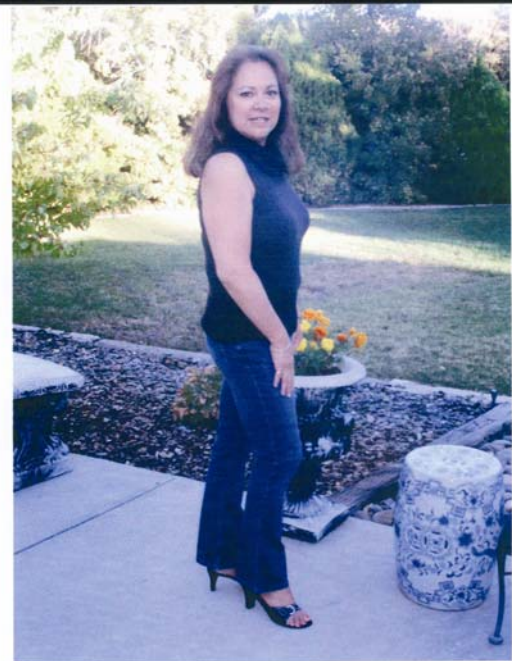
AFTER ISAGENIX CLEANSE

At 44 years of age, I realized that my weight had ballooned to a 190 pounds and I resigned myself to the fact that I would be like this the rest of my life.