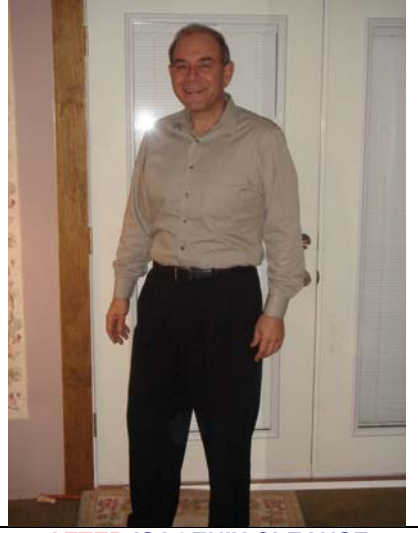
BEFORE ISAGENIX CLEANSE