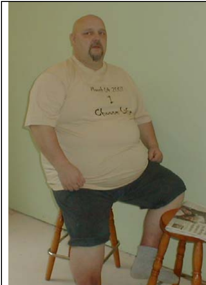
BEFORE ISAGENIX CLEANSE Weight: 392 Pounds March 10, 2007