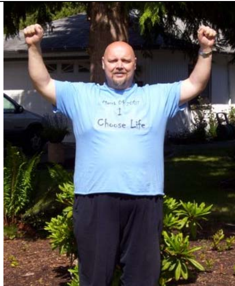
IN PROGRESS . . . May 10, 2007