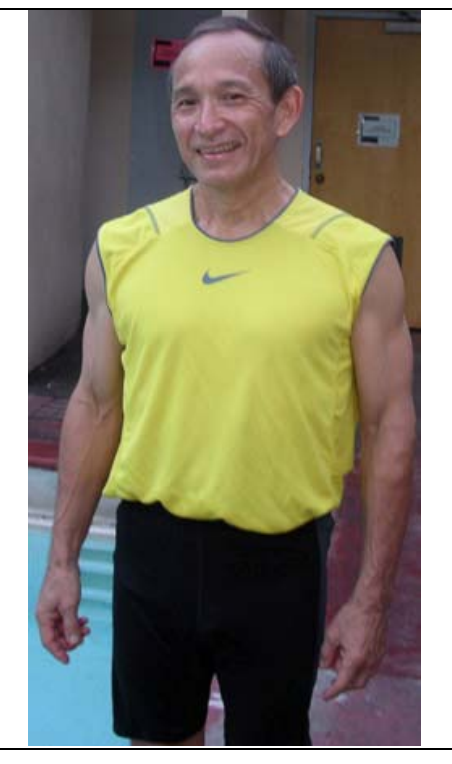
AFTER ISAGENIX CLEANSE Weight: 142 Pounds Waist: 33"

I've always had a passion for good food and have spent significant time and resources pursuing it. Over time, however, I've grown concerned over my inability to control my weight and the food portions I'm consuming. When I reached 192 pounds on my 5'6" frame 3 months ago (bmi = obese), I had continuous nagging feelings that this trend could only lead to serious medical problems. I started to exercise but concluded that I needed more help.