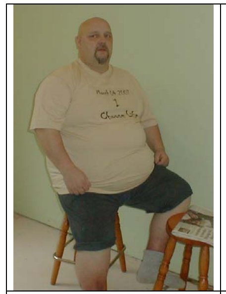
BEFORE ISAGENIX CLEANSE Weight: 392 Pounds March 10, 2007

"Get Busy Living or Get Busy Dying" - The Shawshank Redeption